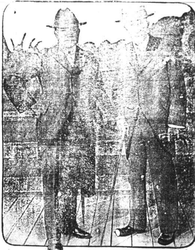
Both John D. Rockefeller and his son were slightly indisposed on their winter estate at Ormond Beach, Fla. Now they have recovered and this photo shows them after a mile walk returning from Sunday services in the Ormond Union Church.