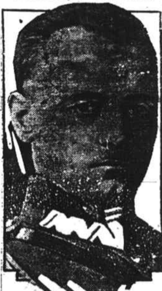
Premier Sikorski of Poland was one of the first to protest against the death sentence of Archbishop Zepiak, head of the Roman Catholic church in Russia. Sentence was suspended after other nations joined with Poland in condemnation of the Soviets' action.