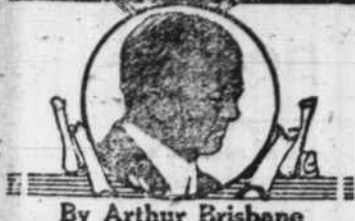
By Arthur Brisbane