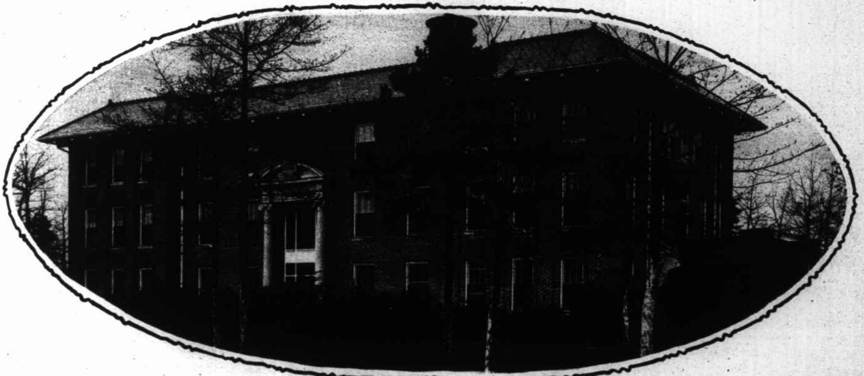
ROANOKE RAPIDS HOSPITAL

The present hospital represents an investment of approximately $100,000.00, and an additional investment of $20,000.00 for a Nurse's Home.