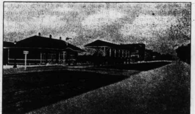
Norfolk Southern R. R. Station

Those seeking an Ideal Permanent Residence will find an appealing atmosphere among our people.