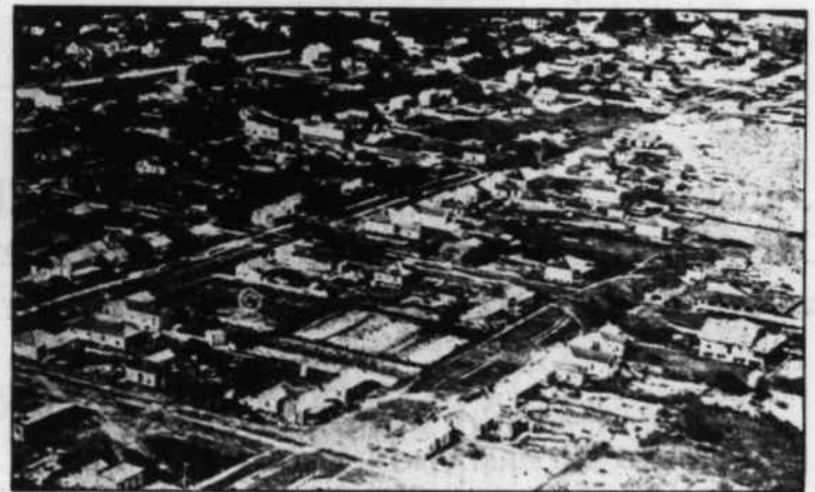
Bird's Eye View of Morehead City