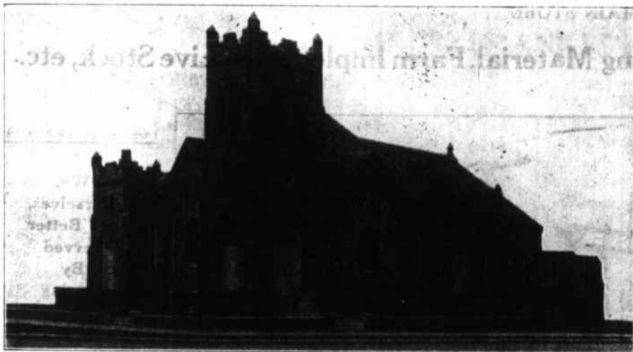
Benson Methodist Church

MANUFACTURING: Opportunities to those who have capital and with a purpose toward manufacturing are most excellent. Hitherto manufacturing has been largely a producer of the raw product rather than a manufacturer of the raw product. To this, the more intricate problem, little attention has been paid. The sentiment, locally, however is to aid and foster manufacturing in every way possible and free taxes for five years and free sites are offered to those who will come in and start manufactories. Manufacturing at present in this section is principally confined to wood-work plants. One of the largest woodwork shops in Eastern Carolina will be found here.