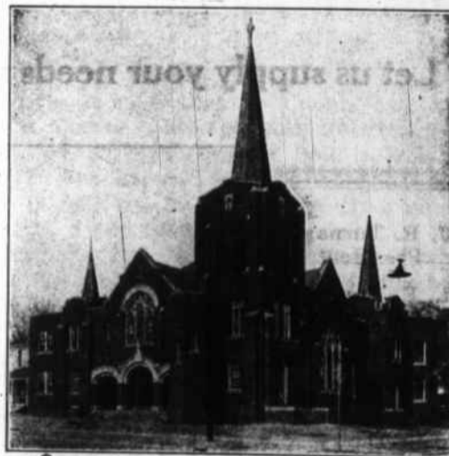
Benson Baptist Church