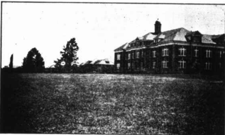
Partial view Eastern Carolina Teachers College