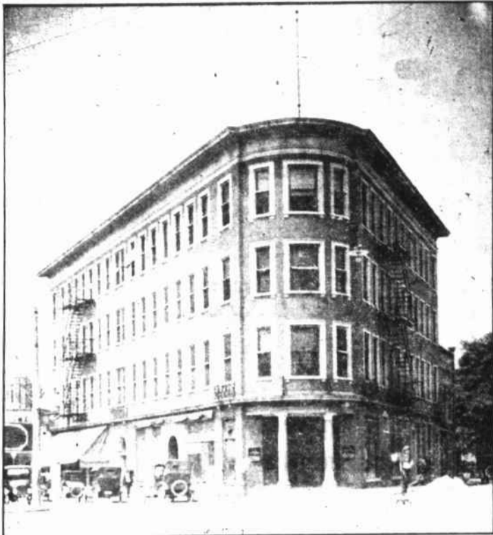
National Bank of Greenville