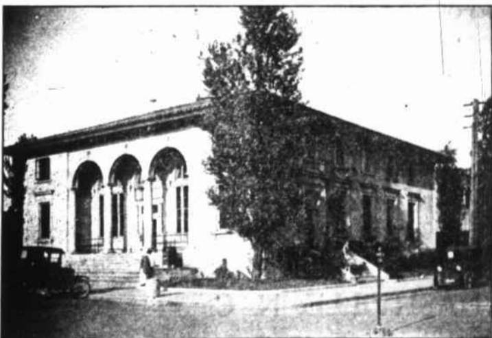
Postoffice at Greenville