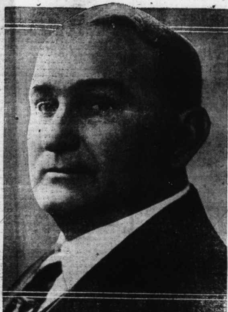
SENATOR JOSEPH T. ROBINSON