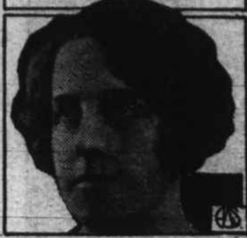
Miss Ruby M. Ayres, author of "Broken," acclaimed by critics as England's foremost woman novelist.