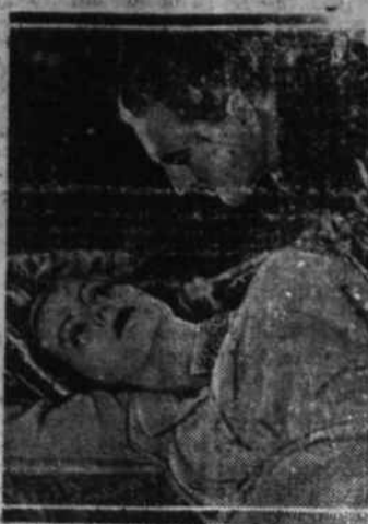
GRETA GARBO and JOHN BARRYMORE in GRAND HOTEL