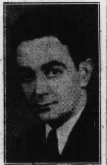
D. STATEN INSCOC