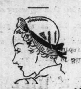
LADIES' HATS $1.98 value for .....