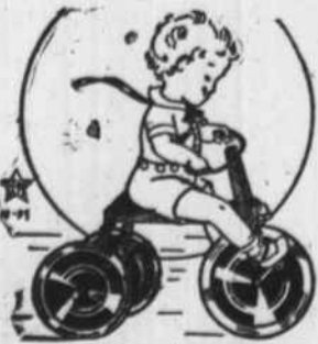
TRICYCLES A size to fit all the children.