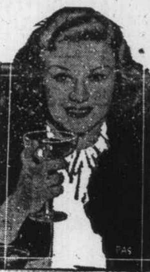
GINGER ROGERS in "THE GAY DIVORCEE"

AT LOUISBURG THEATRE THURS.-FRI., DEC. 27-28