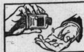
1. Take 2 BAYER Aspirin Tablets. Make sure you get the BAYER Tablets you ask for.

Ache and Discomfort Eased Almost Instantly Now