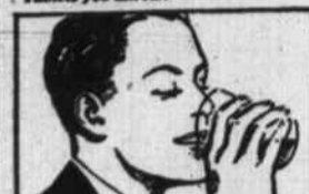
2. Drink a full glass of water. Repeat treatment in 3 hours.