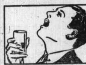
3. If throat is sore, crush and stir 3 BAYER Aspirin Tablets in a third of a glass of water. Gargle twice. This eases throat soreness almost instantly.