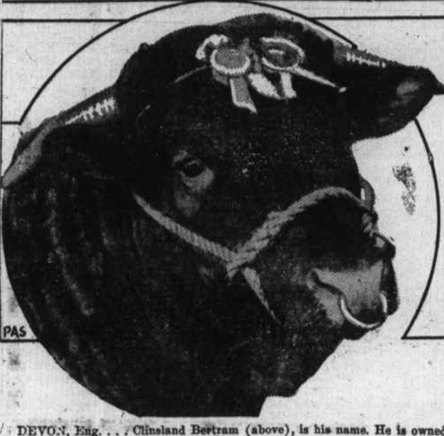
DEVON, Eng. . . . Clinsland Bertram (above), is his name. He is owned by the Prince of Wales. He has just been judged a grand champion, the finest of pure-bred Devon bulls in the 74th annual Devon show.