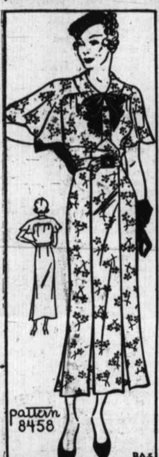
Designed in Sizes: 32, 34, 36, 38, 40, 42 and 44. Size 38 requires 5 1/4 yards of 39-inch material, with 1 1/2 yard of ribbon 3 inches wide for bow.

A SHIRTWAIST DRESS Pattern 8458—The shirtwaist style of frock has captured the devotion of women near and far, and with good reason for it is the most becoming and satisfactory design for almost any occasion—depending on the material in which it is made. The style pictured has the small rolling collar and bow tie so much in demand, together with the saddle shoulder and flaring sleeves which are most desirable in warm weather. Inverted pleats at the end of the front panel and side seams give plenty of fullness in the skirt. This design would be effective in either silk or cotton. A checked design in rayon crinkled crepe in tones of brown and yellow would be striking with brown accessories.