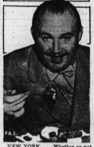
NEW YORK . . . Whether or not Paul Whiteman, king of jazz, believes the old legend that those who eat the first oysters of the season protect themselves from illness for the winter, is not known . . . But he did agree to dine on them to let America know that the "R" season is here again.

secured thereunder, the undersigned will, on SATURDAY, OCTOBER 12, 1935, at the hour of noon, at the courthouse door in Louisburg, N. C., sell to the highest bidder, for cash, the following lands: