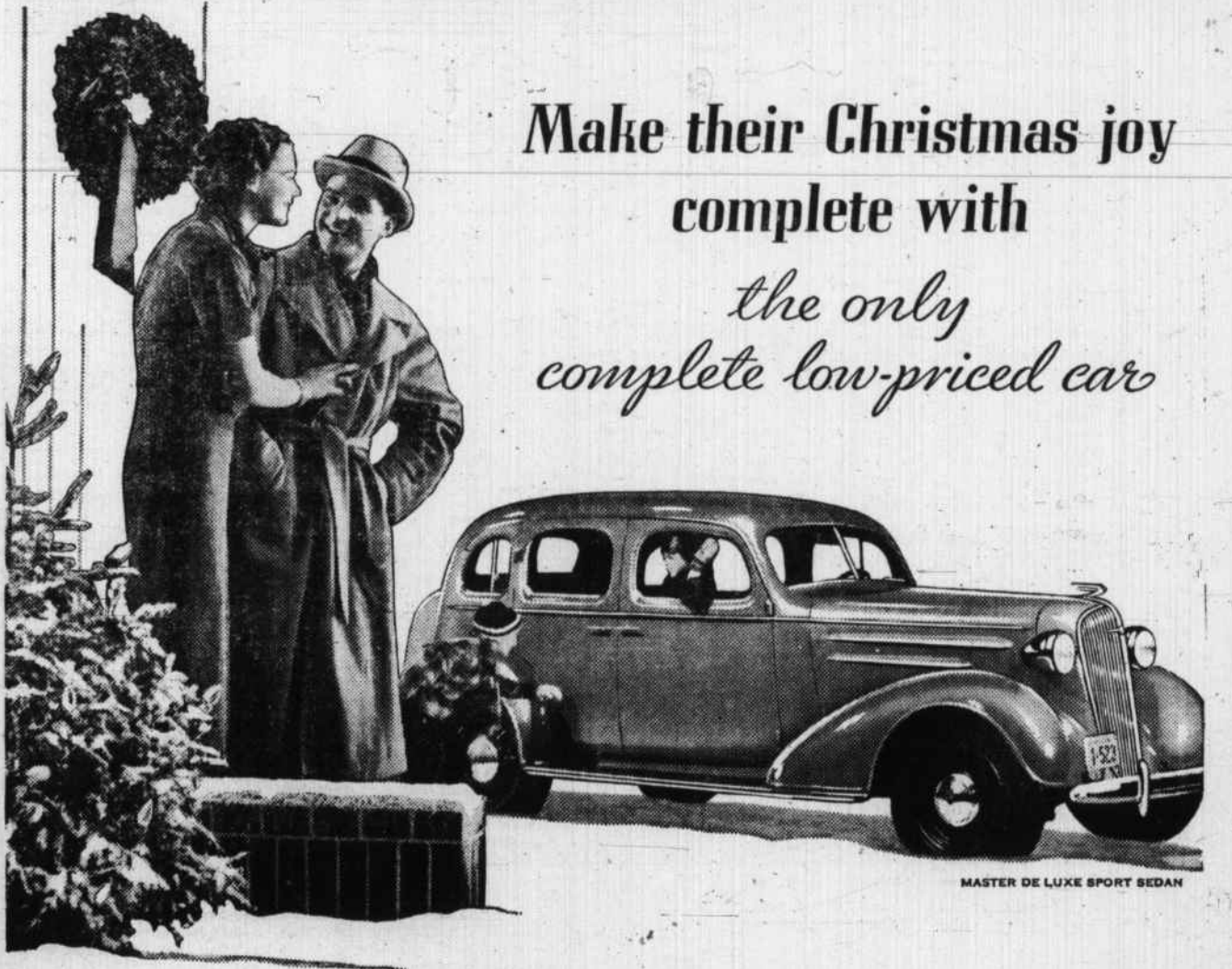
MASTER DE LUXE SPORT SEDAN

Make their Christmas joy complete with the only complete low-priced car