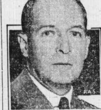
WASHINGTON... Gen. Douglas MacArthur, (above), retiring chief of staff of the U. S. Army, in his farewell report recommends a motorized plan which will transform our regular army, in five years, to a model force for speed and efficiency.