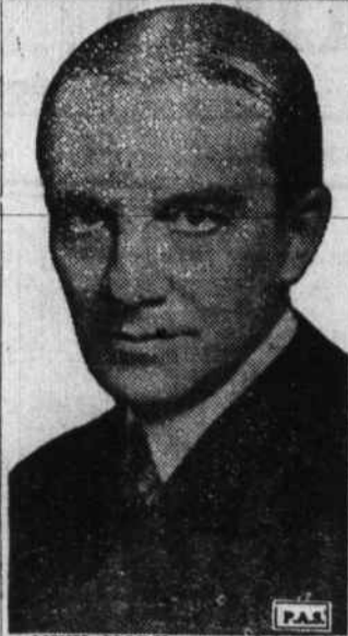
NEW YORK Owen D. Young (above), international figure in the worlds of industry and finance, has been awarded the fellowship and gold medal of the Society of Arts and Sciences for 1936 "for his contributions to this is the 54th annual award by the Society of Arts and Sciences.

ately, should use separate eating and drinking utensils which should be sterilized after using. Should use sputum cups to spit in, paper napkins to sneeze and cough in. These should be burned after use. Avoid kissing and all intimate contact with every one. These are some of the many rules.