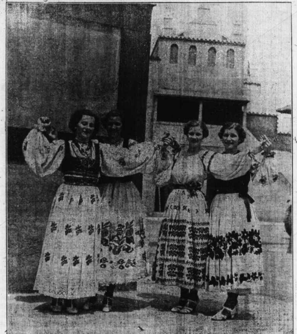
Here is a quartet of attractive Hungarian girls who perform one of their native dances in their native village in the Streets of the World at the Great Lakes