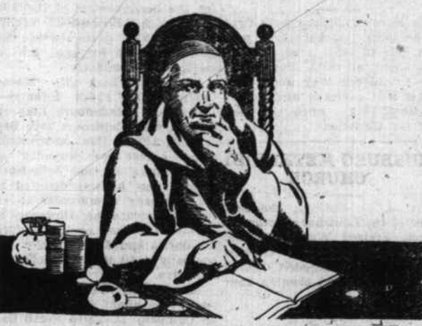
FIGURE TO Have Money

DLENTY of good business opportunities will come to you this year. Don't hurry to invest. Do not shut your eyes to these facts . . . with plenty of money SAFE in our Bank, plus an A-I business proposition, plus sound business judgment . . . these three things are necessary for your success. START SAVING REGULARLY NOW