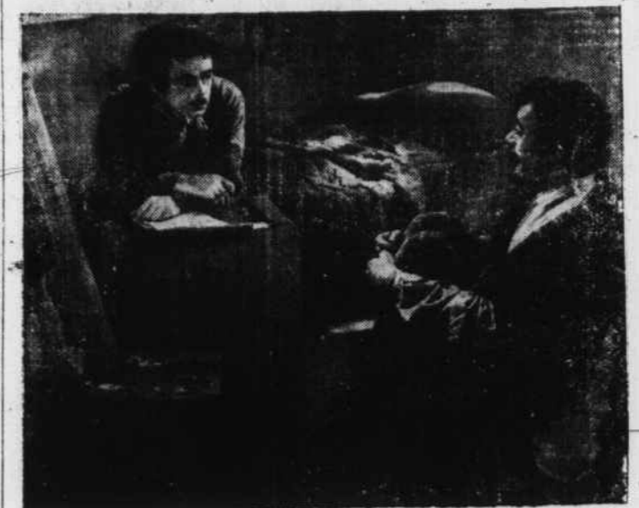
Scene from "Life of Emile Zola" with Paul Muni

ter under study. Question: Will everybody out of a job get unemployment compensation?