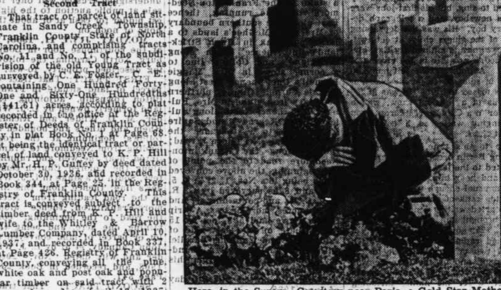
Here, in the Supreme Cemetery near Paris, a Gold Star Mother weeps beside the grave of her boy twenty years after he left home to make the World safe for Democracy.

Between 700 and 800 delegates from the 47 clubs of North Carolina are expected to attend the annual short course at State College, July 25 to 29.