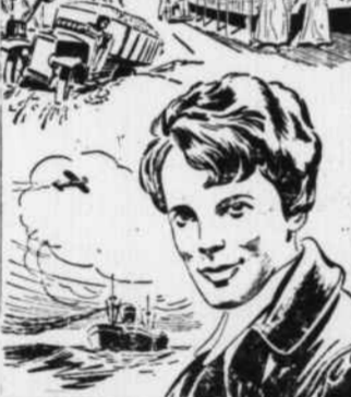
FAMOUS AVIATRIX ONCE DROVE A TRUCK

THIS is a note of encouragement for parents who may not understand them. Girls who fall into the classification of "tom-boys" usually simply have a stronger spirit of competition or a greater streak of adventure than other little girls. Their greater activity may be early expression of a sense of leadership which may later lead to fame.