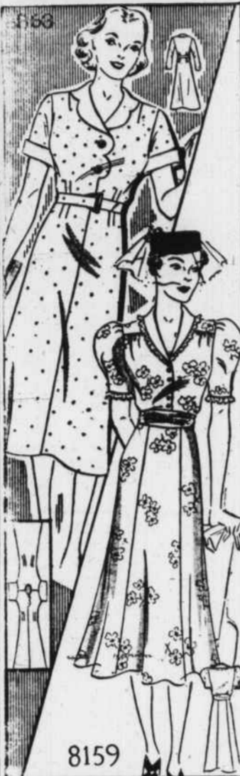
FOR HOME AND DRESS Pattern 8868

Women with a desire to look slim and comfortable around the house will find this pattern a grand choice. Note how very easy it is to make. Back and front are each cut in one piece from shoulder to hem and the front closing is neatly scalloped for a very trim finish. The short sleeves are set in to give you plenty of freedom about your work and the waistline is darted for a smooth, long line.