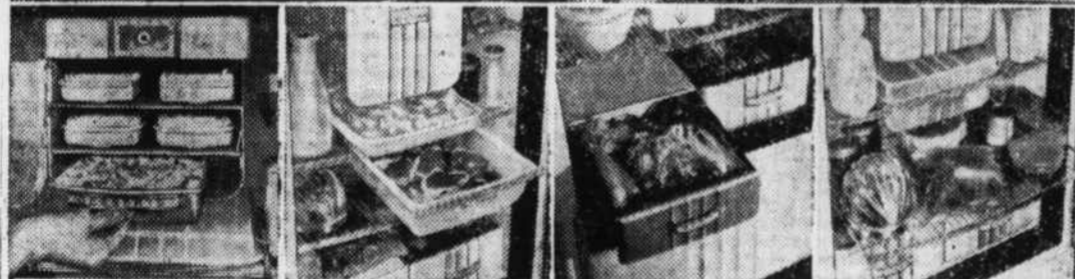
SUB-FREEZING STORAGE LOW TEMPERATURE WITH HIGH HUMIDITY STORAGE MODERATE TEMPERATURE, HIGH HUMIDITY STORAGE SAFETY-ZONE GENERAL STORAGE

SEE G-E's New Quick-Trays that release two or more cubes at a time—freeze up to 48 lbs. of ice in 24 hours, and other features that make General Electric the "blue-ribbon" refrigerator of the year.