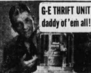
G-E THRIFT UNIT daddy of 'em all!

"SEE G-E!" That's the hot tip among thrifty refrigerator shoppers this year. The new 1939 G-E is high, wide and handsome but way down low in price. Never before has America bought so many General Electric Refrigerators in a similar period. It's a blue-ribbon winner!