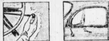
Gearshift on Steering Post - Controlled Ventilation