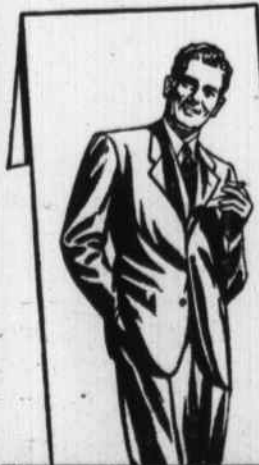
Taylor Custom-Made Clothes

Taylor Custom-Made Clothes are the finest in the country.