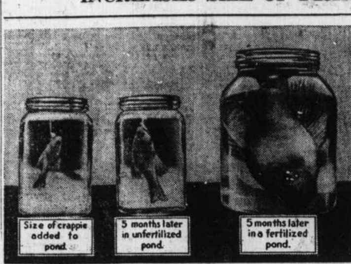
Size of crappie added to pond. 5 months later in unfertilized pond. 5 months later in a fertilized pond.

One of the latest wonders of modern science is the discovery that the size of fish may be greatly increased by the use of fertilizer to promote the growth of underwater vegetation.