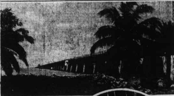
SEA-GOING HIGHWAY Buses and cars actually cross the ocean on the Overseas Highway which links the keys between Miami and Key West, Florida.

NATURAL AND MAN-MADE WONDERS DESCRIBED IN NEW RADIO PROGRAM