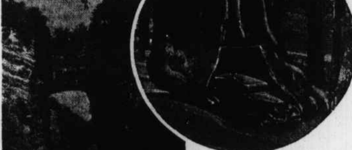
TUNNEL THROUGH TREE In Wawona Grove, California a busy highway passes right through a giant redwood tree.