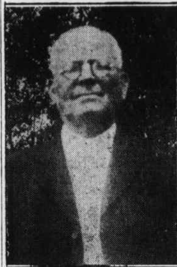
S. S. MEADOWS