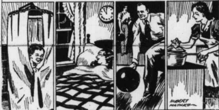
TO DO OUR BIT WE MUST KEEP FIT.

THE NATIONAL ASSET OF HEALTH CAN BE INCREASED—THE DRAG AND BURDEN OF SICKNESS DIMINISHED—BY FOLLOWING THE COUNSEL OF LIFE INSURANCE COMPANIES, AND PAYING EXTRA ATTENTION TO HYGIENE, SLEEP, EXERCISE AND SCIENTIFIC NUTRITION.