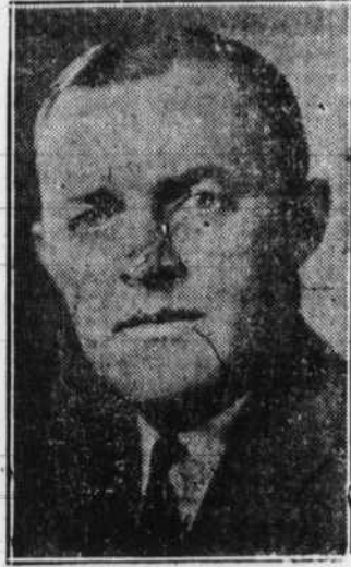
CONGRESSMAN HAROLD D. COOLEY