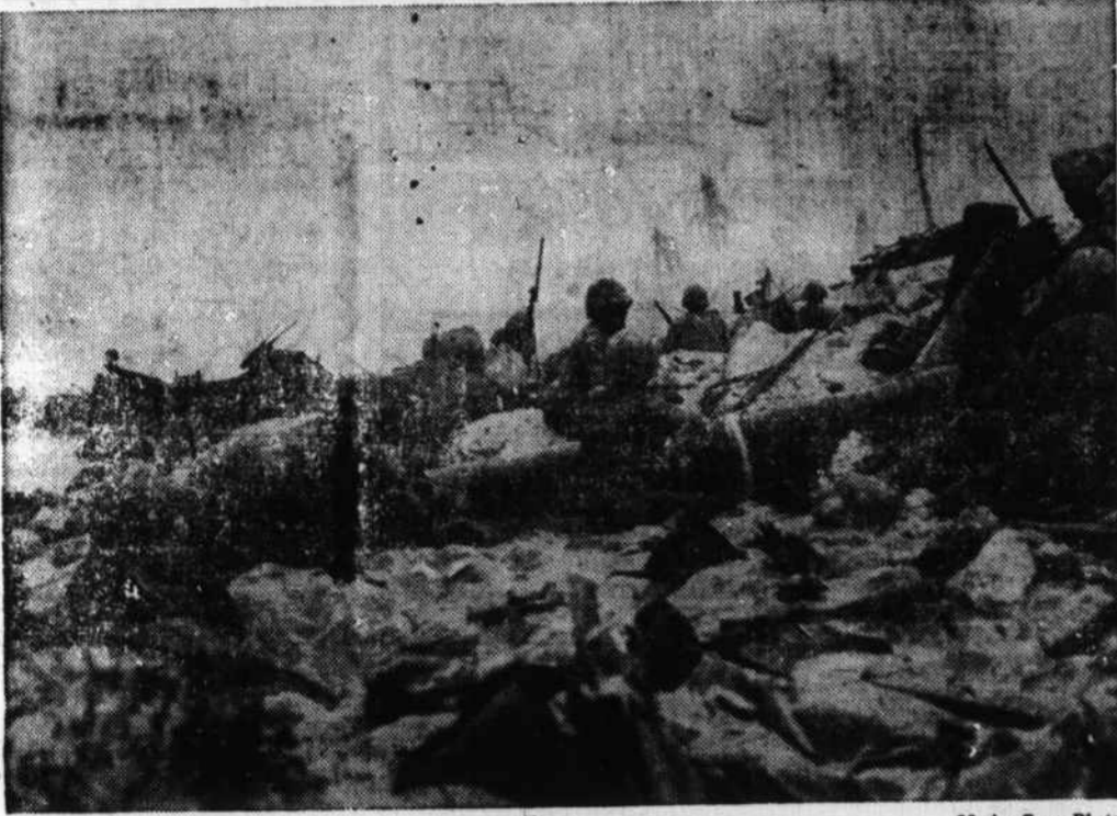
Marines duck for cover as their own dive-bombers roar overhead to blast Jap positions. In the background is an amphibian tractor (left) and a medium tank (center). There was little or no cover for the men when they landed on Tarawa's beach, as is plainly shown in this picture. Let's Back the Attack by buying extra War Bonds. From U. S. Treasury