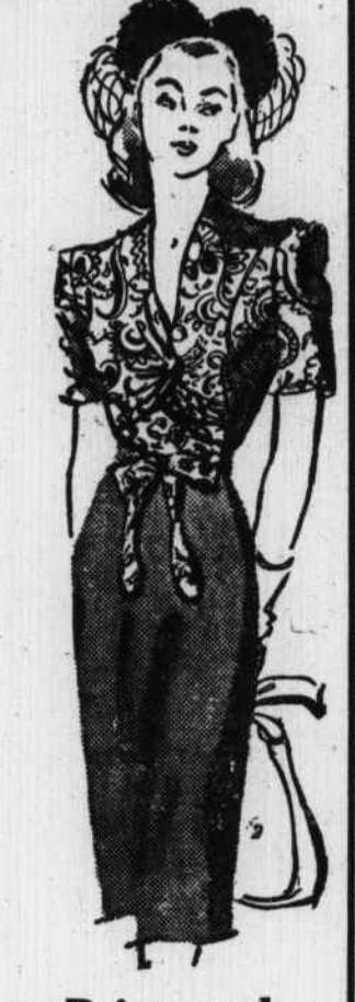
Print and Plain News!

Perfect for your busy Spring days! Beruffled print casuals you'll wear 'round the clock—prize for their young, fresh look. See the entire col-