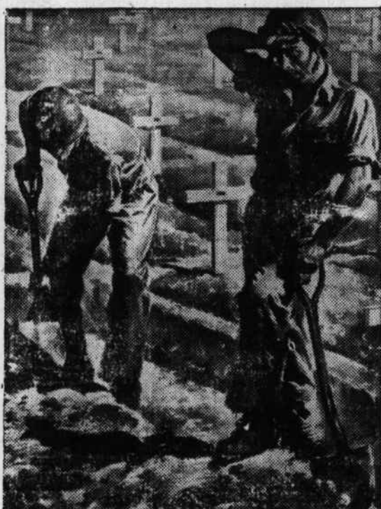
"... Ask those who bury our dead!"