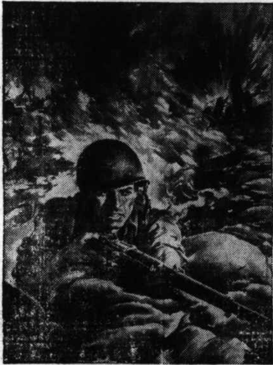
"... Ask the Joes in the front lines!"