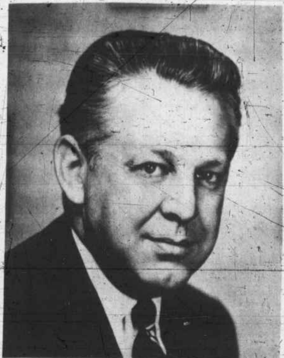
Founders Day Speaker