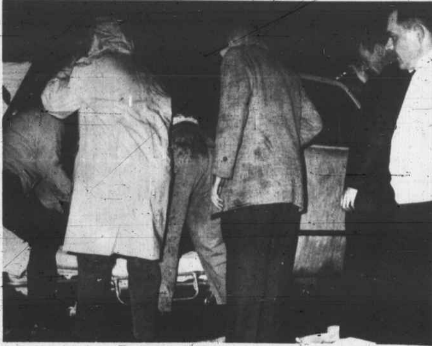
Rescuers Remove Victim

Members of the Louisburg Rescue Service are pictured removing one of the victims in a three car crash near here from