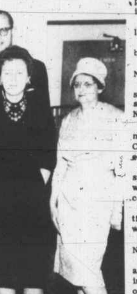
At Cancer Society Meet

mains two seats to be filled. Things at this stage of the game certainly point towards