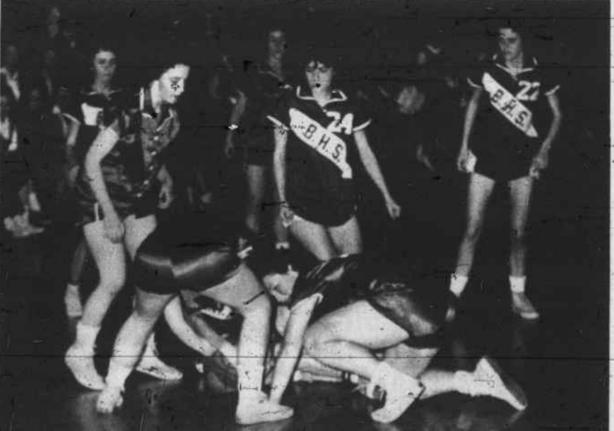
Roll'em On The Floor

Previous committee assignnents included the Chairmanship of the important committee on Courts and Judicial Districts and membership also on the committees on Insurance: Appropriations; and Judiciary