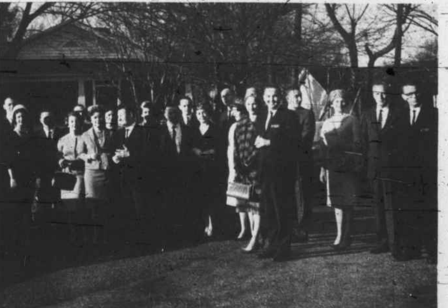
Off For Raleigh Meeting

There will be a stated communication of Louisburg Lodge 413 AF & AM on Tuesday evening March 12th at 7:30 in the Masonic Temple. Work will be in the Third degree. All Master Masons are cordially invited.