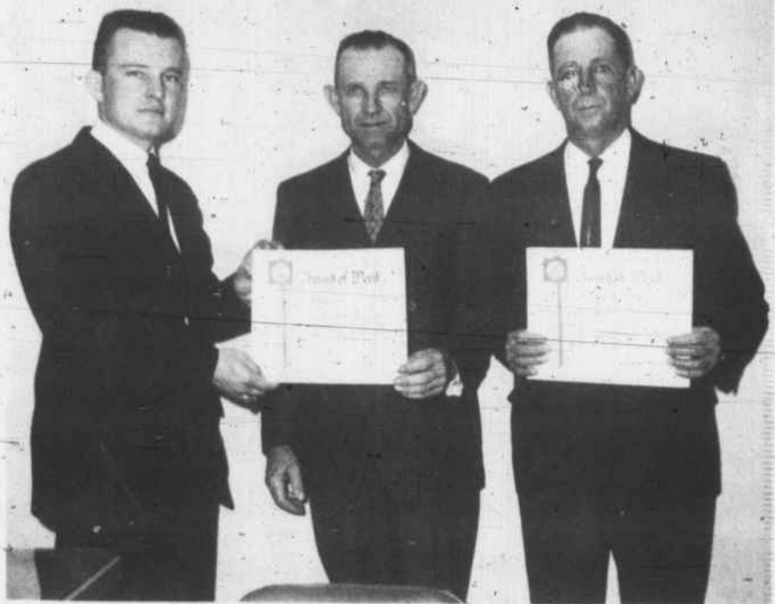
Receive Merit Awards

The town just Monday approved the purchase of a lot on the north side of the River Road adjacent to the Negro Masonic Lodge for the erection of a new sewer pumping station to serve the Mineral Springs section.