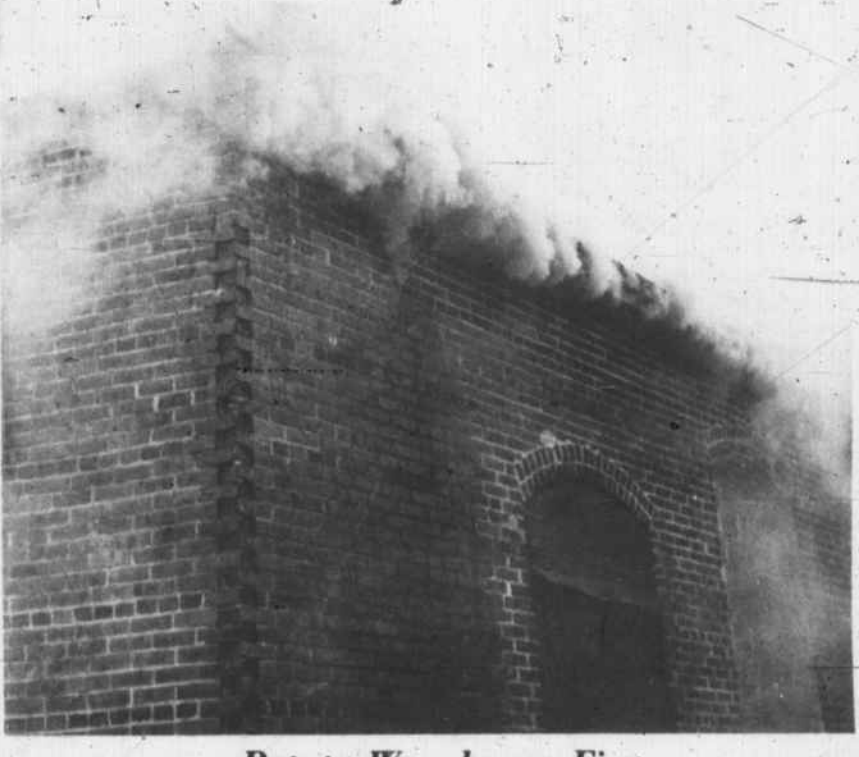
Potato Warehouse Fire

The Easter Seal Campaign will be conducted by 1,375 state and local affiliates of the National Society for Crippled Children and Adults throughout the United States, Easter Seals. in 1962 provided rehabilitation care to crippled in Franklin County regardless of cause of