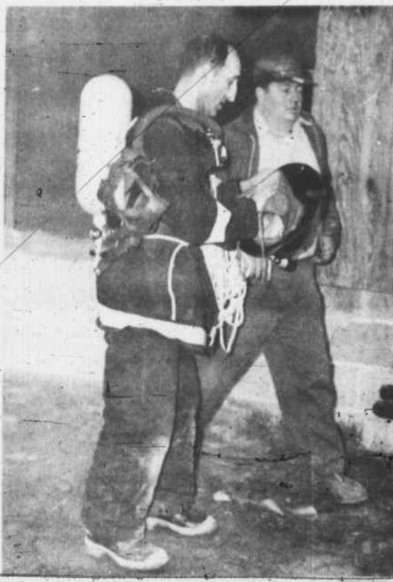
Fireman Dons Mask

Official Washington shrugged off Russia's new missile flexing over Cuba as morale build-A birthday, once a year, gets ers + both for at home and for Castro's regime.