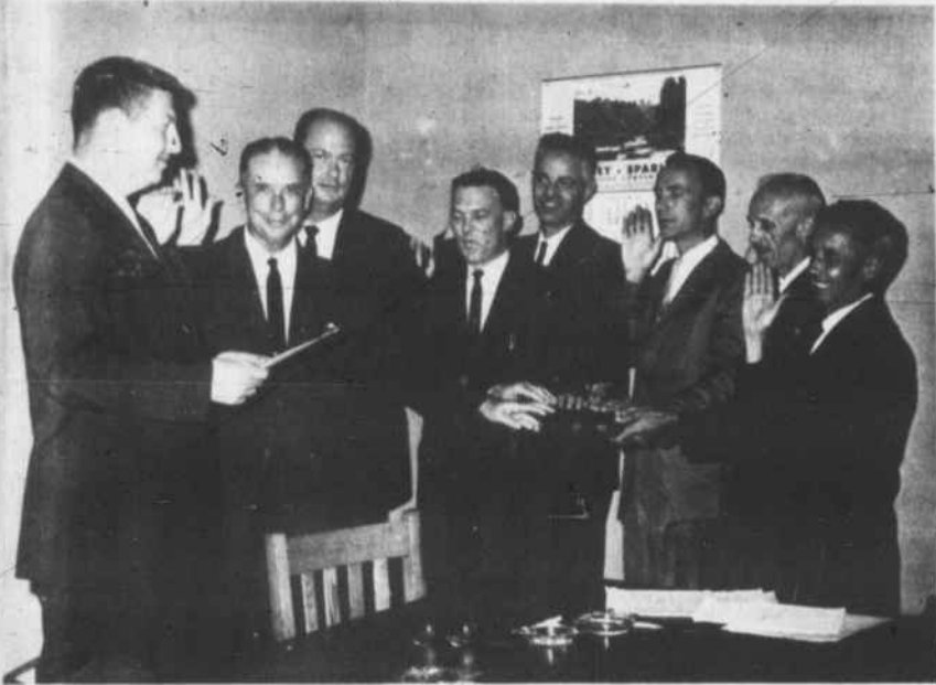
New Council Swear-In

Foolish men work all their lives in order to be able to rest without understanding that they can rest almost any time.