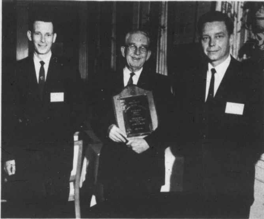
Receives 50 Year Award