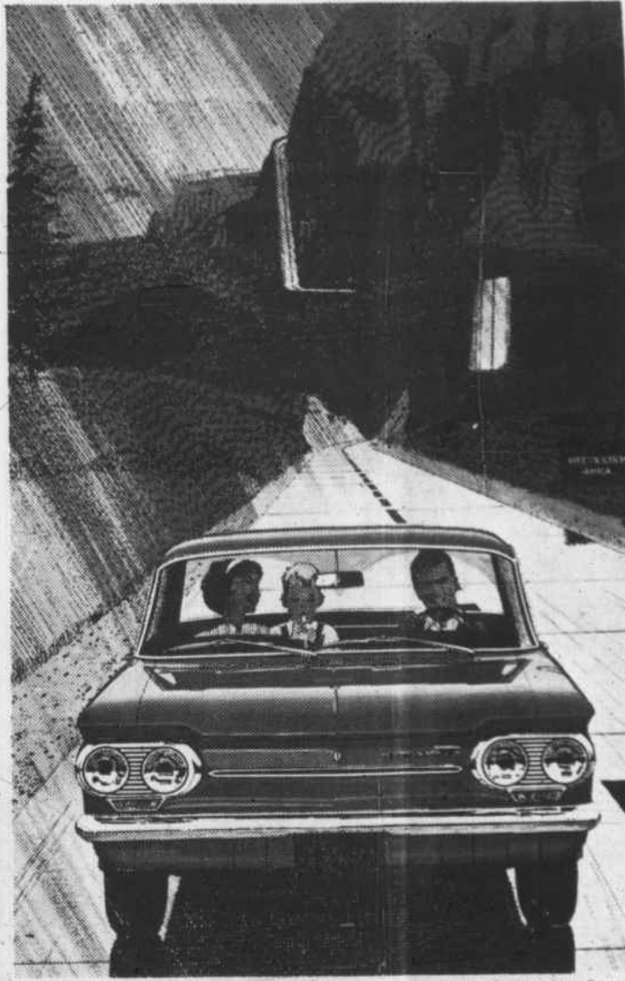
Monza Spyder Club Coupe