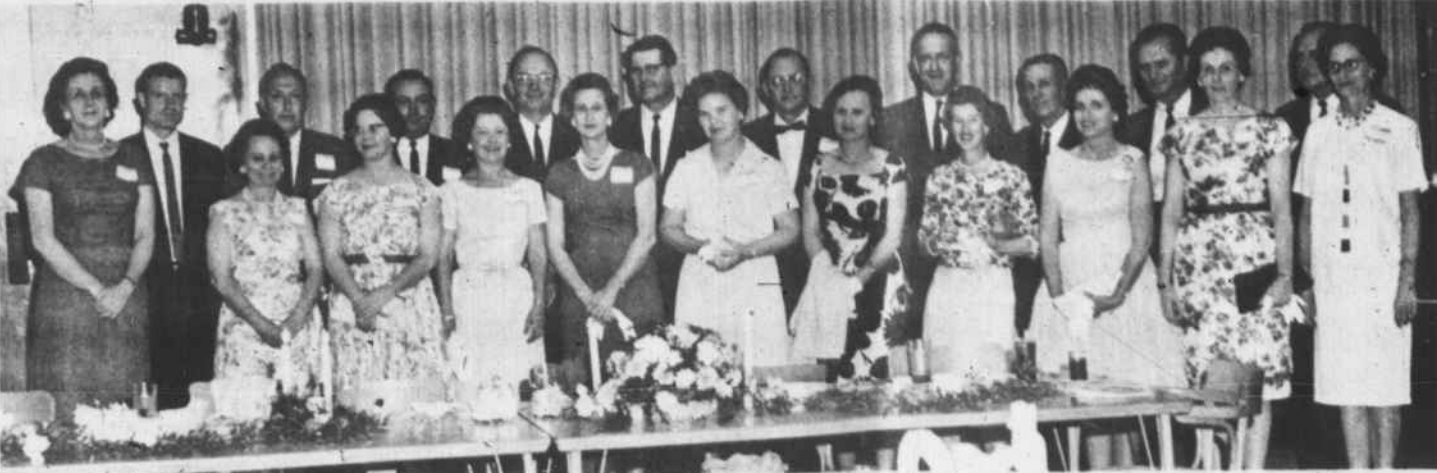
Reunioning Classes At Alumni Banquet

Navy blue and white is the perennial favorite for early spring. A navy sheer two piece suit with a white and navy polka dot blouse or a white blouse is smart. The blouse may be a bow at the throat or a simple neckline that can be dressed up with summer jewelry. Other accessories, shoes, gloves, bags and hats can be of white or a combination of the two colors. It is usually safe to have a matching bag and shoes.