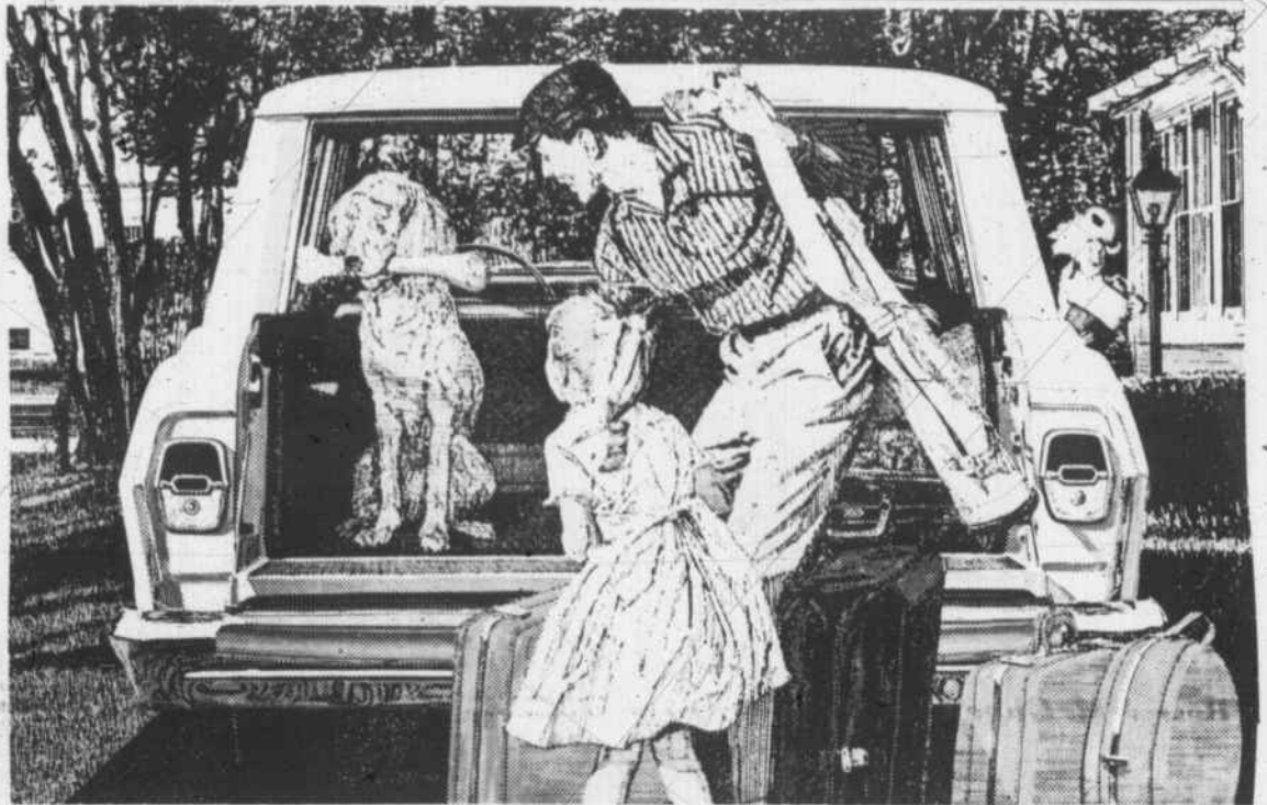
Chevy II Nova 400 6-Passenger Station Wagon

The airplane has made won- derful progress in fifty years but there are still people who do not prefer to ride through the skies.