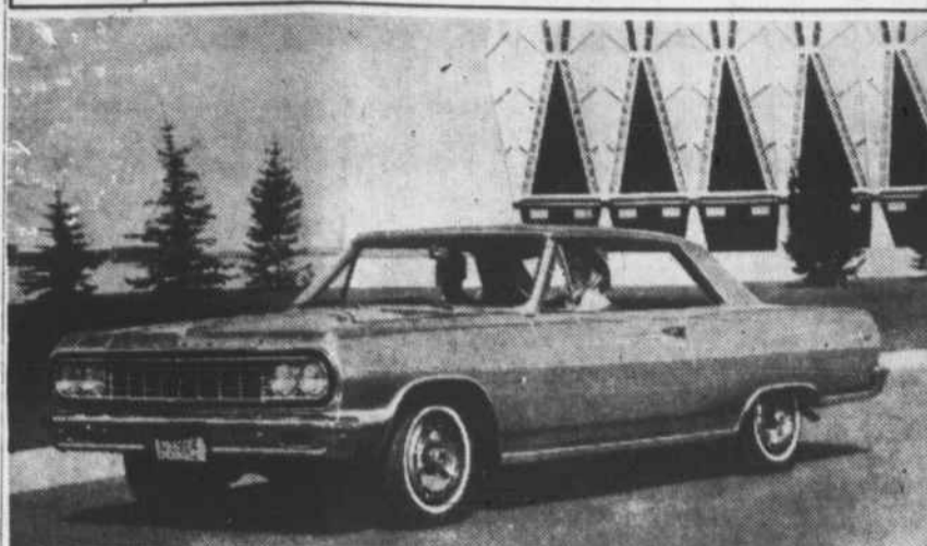
Newest member of the growing Chevrolet passenger car family is the Chevelle. Although 16 inches shorter and 24 inches narrower than comparable Chevrolet models, the Chevelle offers virtually all the interior roominess and smooth fine car feel of a full-size luxury car. The Chevelle Malibu SS Sport Coupe, (shown above) is one of 11 Chevelle models which will be in dealerships beginning September 26. The Chevelle is offered in the Malibu, Malibu SS and 300 Series.