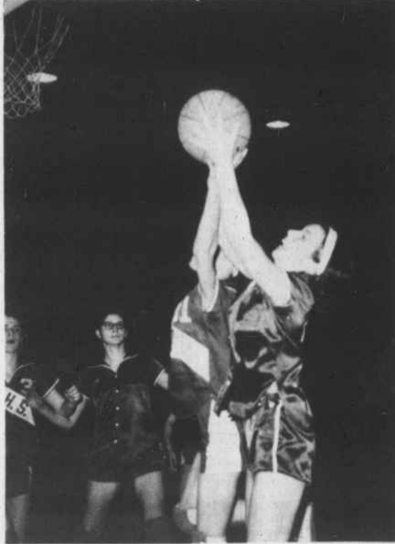
Let It Go, Honey