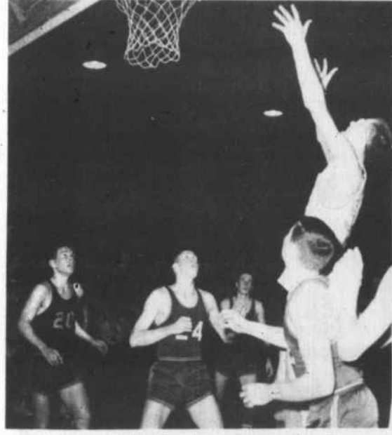
How Tall Can You Get?

And So Does $20! Girl--"You want me to marry, you, and you earn only $20 a month?" Suitor--"Don't worry, dear; a month soon passes when people are in love."