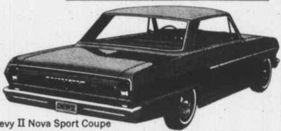
Chevy II Nova Sport Coupe

OR, SAMPLE A NOVA SPORT COUPE (BACK BY POPULAR DEMAND) OR CHEVELLE SPORT COUPE