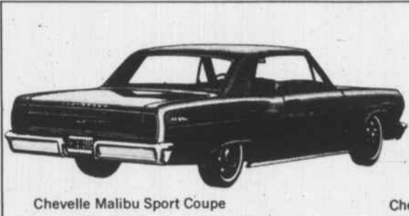
Chevelle Malibu Sport Coupe

Customized steering adjustment at low cost! (Comfortilt Steering Wheel) *Optional at extra cost on most models.