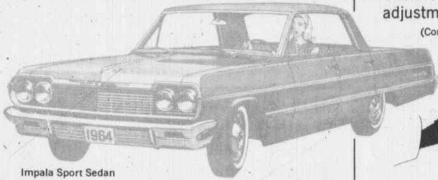
Impala Sport Sedan

Customized steering adjustment at low cost! (Comfortilt Steering Wheel) *Optional at extra cost on most models.