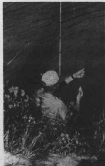
Big Chief, Small Fish