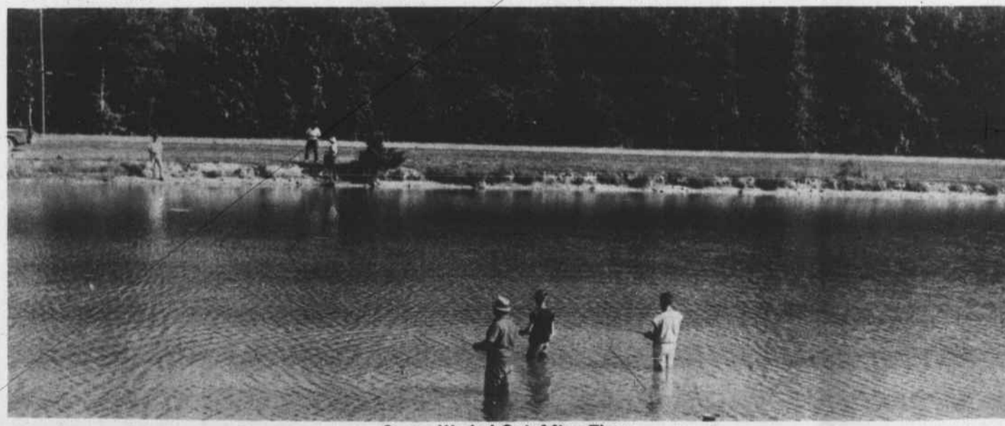
Some Waded Out After Them