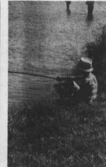
Not A Care