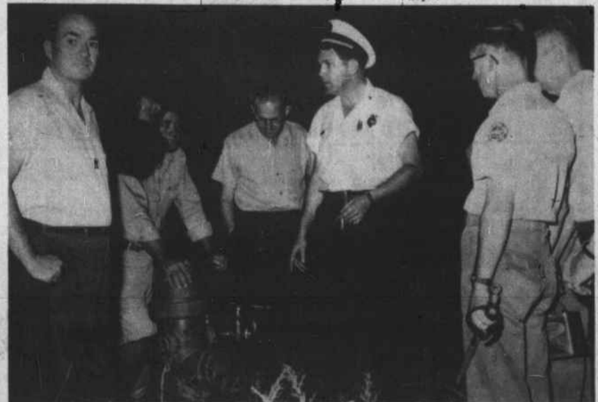
Firemen Get Training