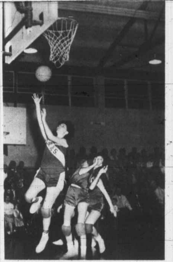
Bunn Tops Epsom