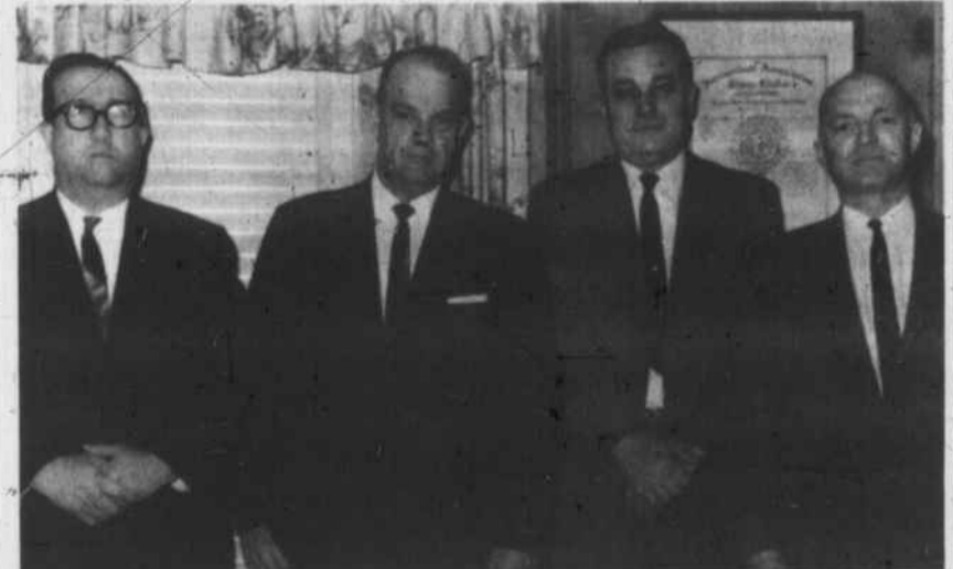
Rotary Meeting Principles