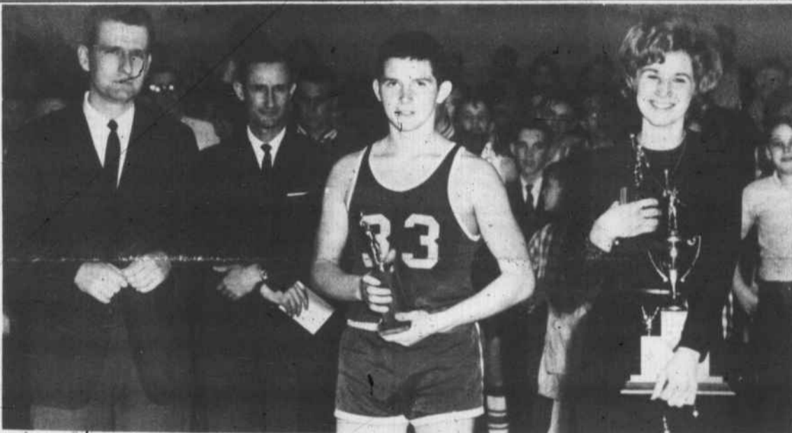
Most Valuable Players